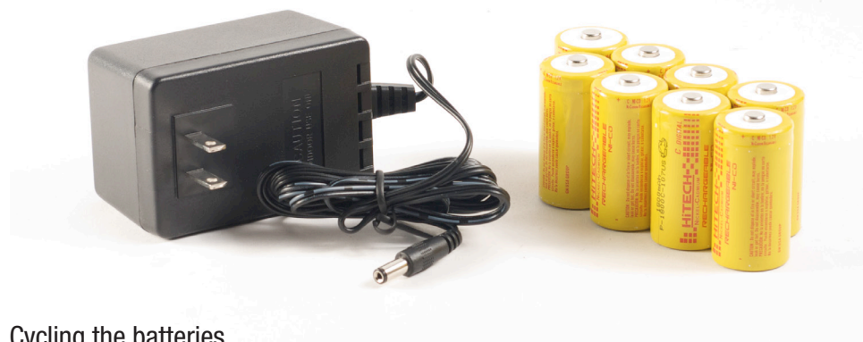
RC-LBH BATTERY KIT