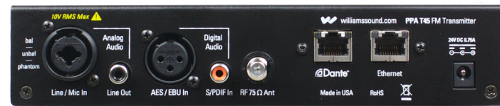
PPA T45 NET D

The PPA T45 NET and NET D models fully integrate with modern networked sound systems. They feature 3 powerful microprocessors and the same high-quality audio and RF performance you've come to expect from Williams Sound. They also offer an adjustable RF output and a sleep mode for energy conservation. It's technology that takes the guesswork out of complex audio installation. Simply select between voice, music, or hearing assistance in the audio preset menu, and this transmitter quickly configures itself.