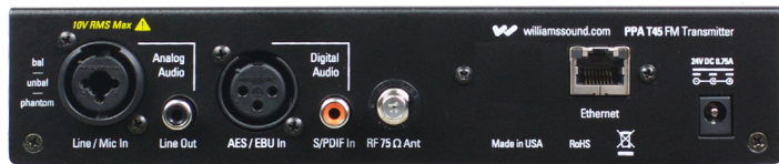
PPA T45 NET

The cutting-edge PPA T45 models take hearing assistance to a whole new level, with network control capability from any remote location, optional Dante™ audio input, multiple digital and analog audio input options, and an OLED high-res screen with easy-to-manage menu navigation.